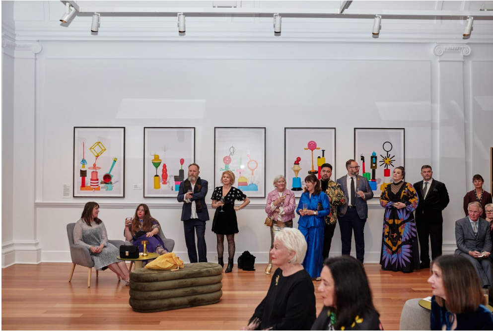
Douglass Gallery—a revolving display of significant mid-century works from the Gallery’s collection collection.