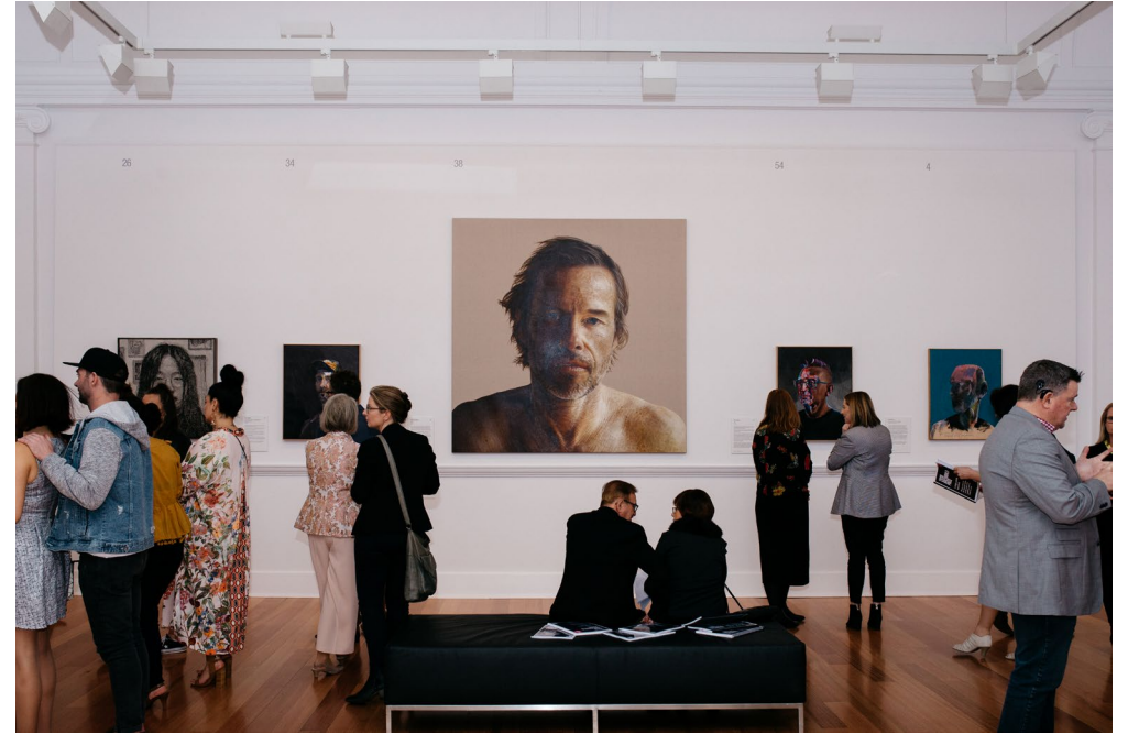
Hitchcock Gallery—iconic 18th and early 19th century works are displayed in this space.