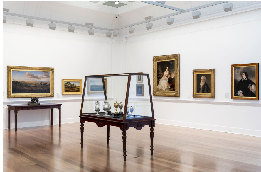
Hitchcock Gallery—iconic 18th and early 19th century works are displayed in this space, suitable for cocktail events and receptions.