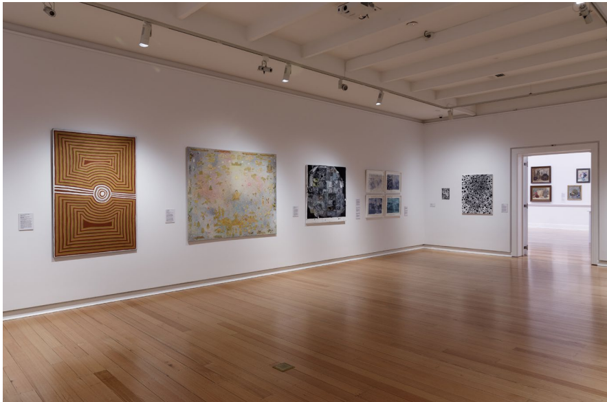
Max Bell Gallery—an intimate venue space showcasing contemporary artists. A drop down screen is also available in this space.