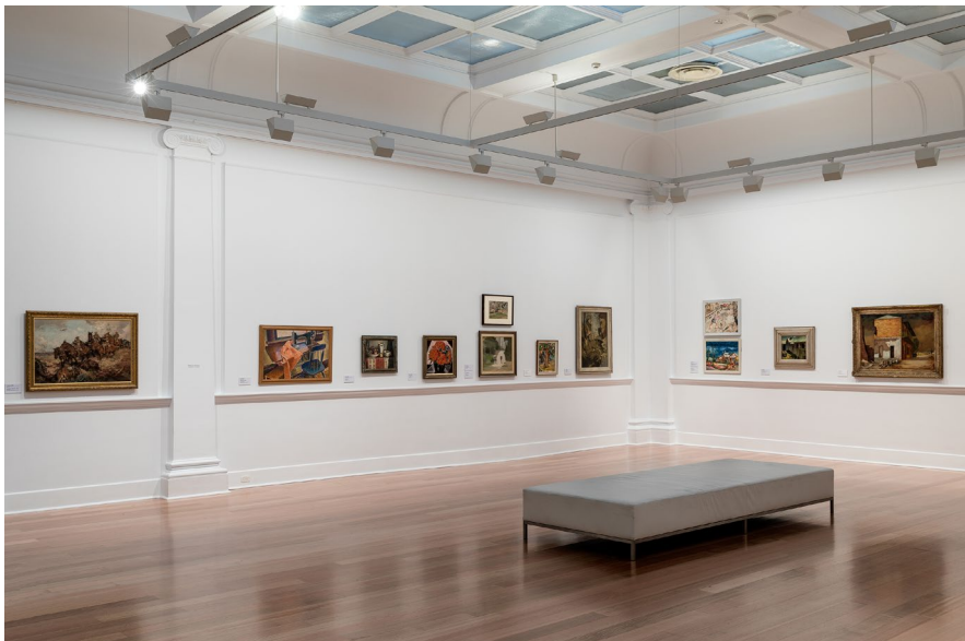
Douglass Gallery—a revolving display of significant mid-century works from the Gallery's collection collection, creates the perfect venue for cocktail, presentations or sit-down events.