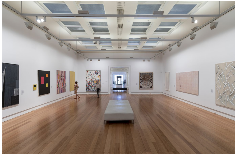
McPhillimy Gallery—bold exhibitions of late 19th and early 20th century works from the collection provide a perfect space for cocktail functions.