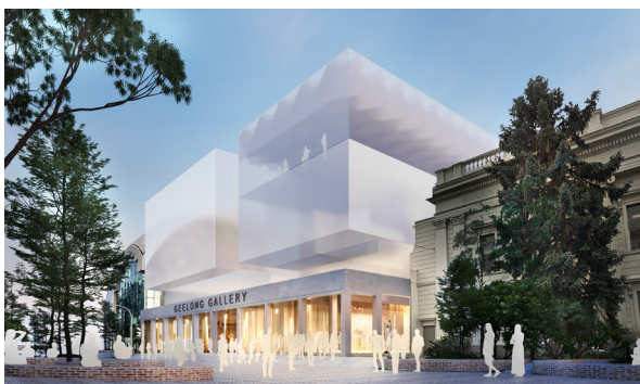
Little Malop Street entrance facade