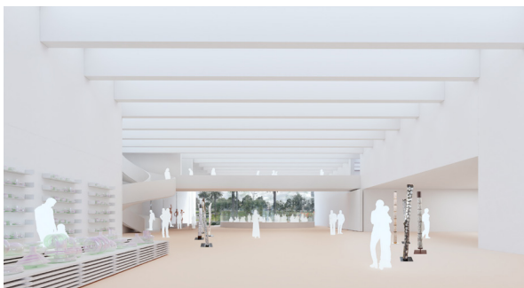
Arrival Hall internal (walking towards Johnstone Park from Little Malop Street)