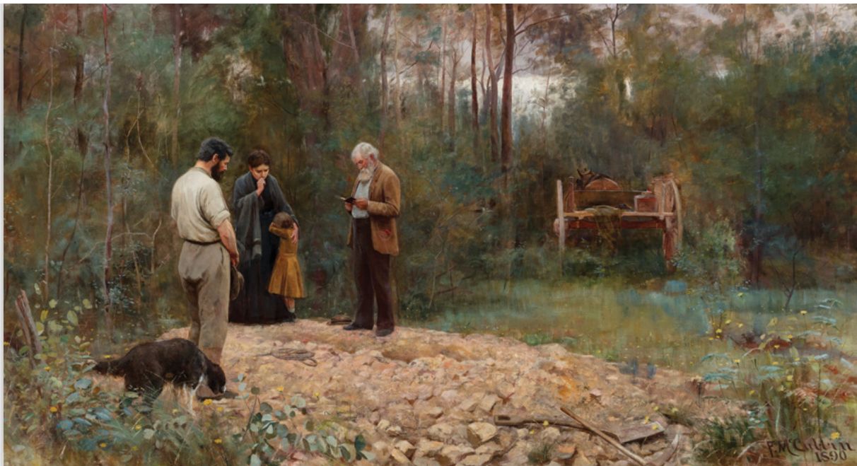
Frederick McCubbin A bush burial 1890 oil on canvas Geelong Gallery Purchased through public subscription, 1900