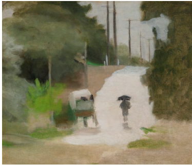
Clarice Beckett Rainy day 1930 oil on canvas on board Geelong Gallery Purchased 1973