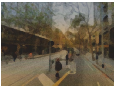
Above image with Atmospheric Lab treatment