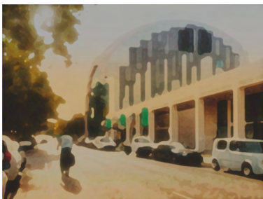
Above image with Atmospheric Lab treatment