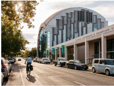
Geelong Gallery exterior, Photographer: Hails & Shine.

A Geelong Gallery immersive experience 1 April to 9 July 2023