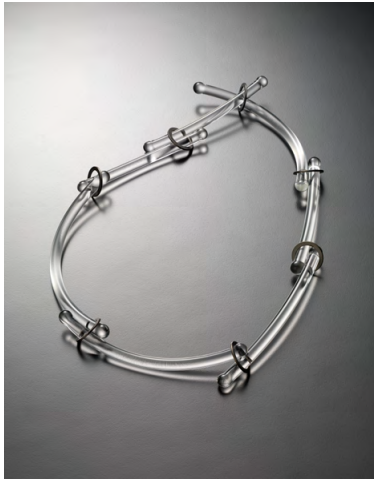
Blanche Tilden Flow 03 (necklace) 2016 flameworked borosilicate glass and titanium Toowoomba Regional Art Gallery, Queensland

A Geelong Gallery touring exhibition 8 May to 1 August 2021