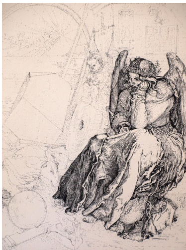
Ian Westacott The winged personification of melancholy II (counterproof) 2022 etching; edition 1/10 Colin Holden Charitable Trust © the artist