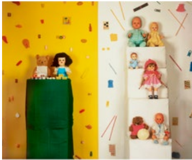
Jacky Redgate Light Throw (Mirrors) Fold — Food Shop and Knitting 2016 silver halide chromogenic photograph handprinted Courtesy ARC ONE Gallery, Melbourne © Jacky Redgate

Free entry Open daily 10am to 5pm Closed Good Friday