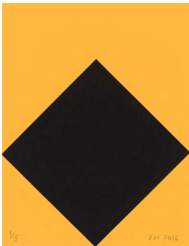
John Nixon Study with coloured paper 2016 woodblock; edition of 5

John Nixon—Four Decades, Five Hundred Prints is the first comprehensive survey of prints by John Nixon (1949–2020), one of Australia’s most distinguished artists. Nixon’s extensive body of abstract prints will be presented exclusively at Geelong Gallery from 18 November 2023.