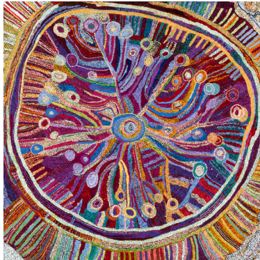
Kunmanara (Wawiriya) Burton, Pitjantjatjara people, South Australia, born Pipalyatjara, South Australia c 1925, died Amata, South Australia 2021, Ngayuku ngura - My country , 2012, Amata, South Australia, synthetic polymer paint on linen, Gift of Lisa Slade and Nici Cumpston 2013, Art Gallery of South Australia, Adelaide, © estate of Kunmanara (Wawiriya) Burton/Tjala Arts