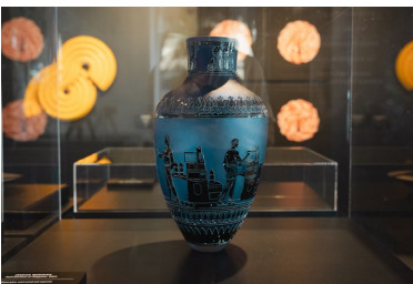
Jessica Murtagh, Self-checkout of Sisyphus 2023 , Australian Design Centre exhibition view 2023