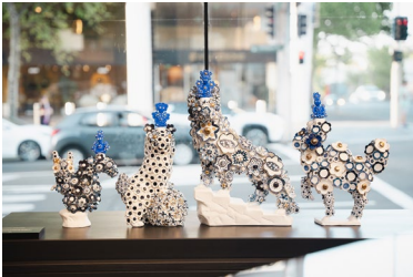
Vipoo Srivilasa, Diverse Dominion Deities 2023 , Australian Design Centre exhibition view 2023, Photographer: Amy Piddington

An Australian Design Centre ADC On Tour national touring exhibition 10 August to 27 October 2024