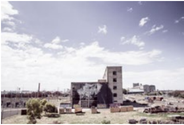
RONE Powerhouse Geelong 2014 Photographer: Rone © RONE

Geelong Gallery is proud to announce the rescheduling of RONE in Geelong following nationwide gallery closures due to the COVID-19 pandemic. The exhibition will now open on 27 February 2021.