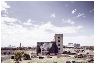
RONE Powerhouse Geelong 2014

Geelong Gallery is proud to announce the rescheduling of RONE in Geelong following nationwide gallery closures due to the COVID-19 pandemic. The exhibition will now open on 27 February 2021.