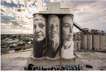
RONE Geelong Cement Works 2018/20 digital print Geelong Gallery Gift of Adelaide Brighton Limited, 2020 © RONE

RONE continues: 'My show is an ode to abandoned spaces and a reminder to value the original treasure they once were. Influenced by the architecture of the building and the toll of time, the central installation preserves an imagined moment of the space adorned at its finest and left to slowly deteriorate. Featuring a push and pull between light and dark, viewers may be compelled to either end of the experience but are united in the same recognition of overall decay. The damage has been done and my installation invokes a longing for what is lost and cannot ever return.'